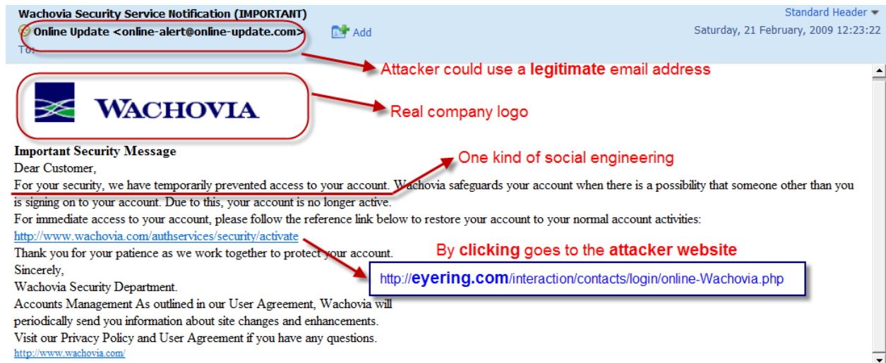
Figure A.1 – Phishing by the email (type 1)