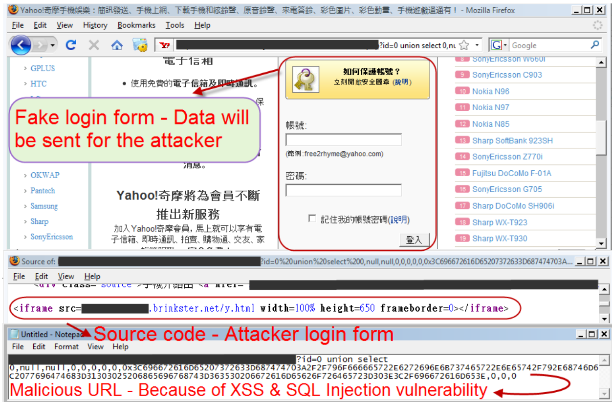
Figure A.3 – Phishing by the website vulnerability (type 5)